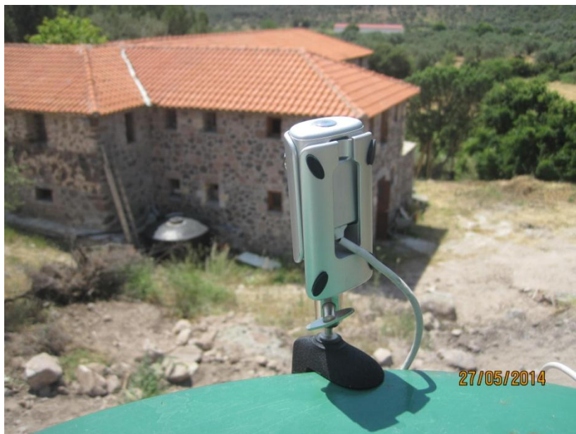
Webcams in position